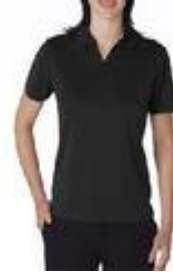
This is more like it!